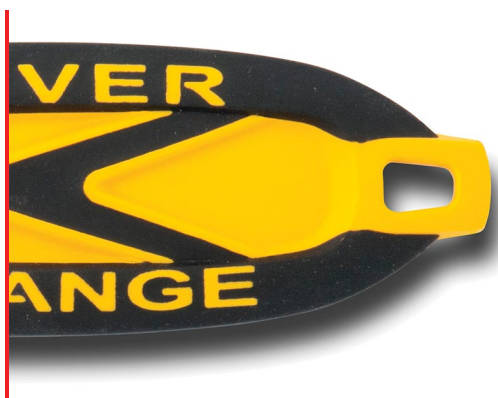
Innovative Plastic Tape Splitter Available in the yellow handle ONLY.