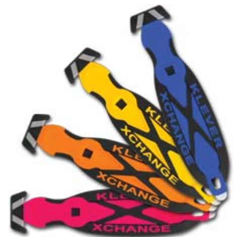
Available in Red, Orange, Yellow, and Blue.