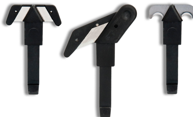
Klever XChange Replacement Heads Interchangeable, quick-change, snap-in heads for the Klever XChange and XChange PLUS Safety Cutters. Visit the Klever XChange Replacement Heads page for more information.