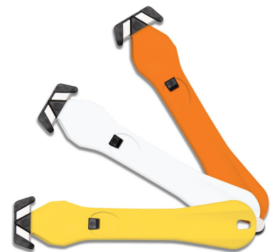
Available in orange, white and yellow.