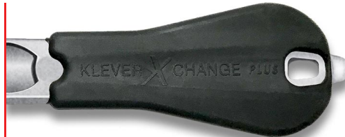
XChange Plus-OM Magnesium handle the ergonomic "soft-touch"