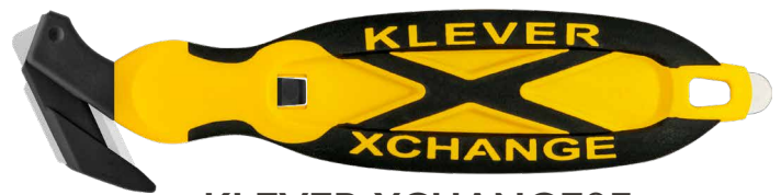
KLEVER XCHANGE35 CONCEALED SAFETY CUTTER