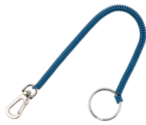
PHC MD Clip-On Coil Lanyard A42003-9